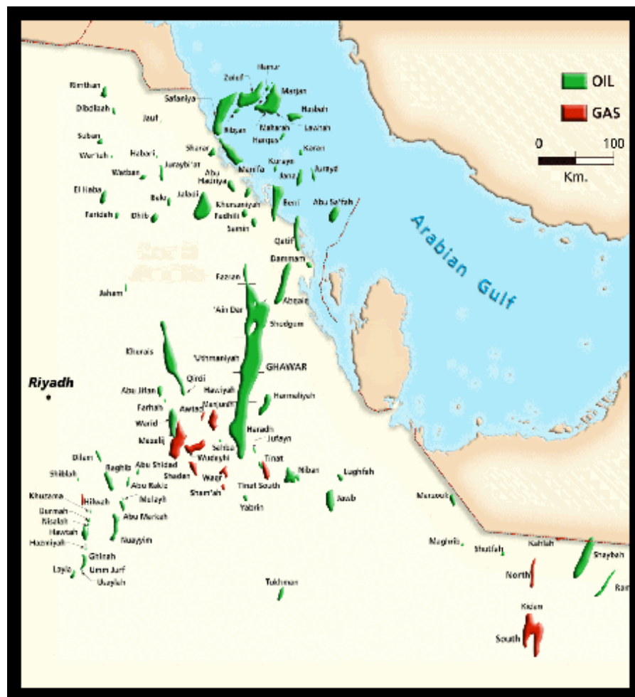
Figure 1. Oil & gas fields dispersed across thousands of kilometres